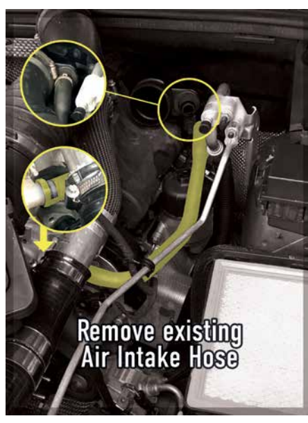
Step 4 / Img 3: