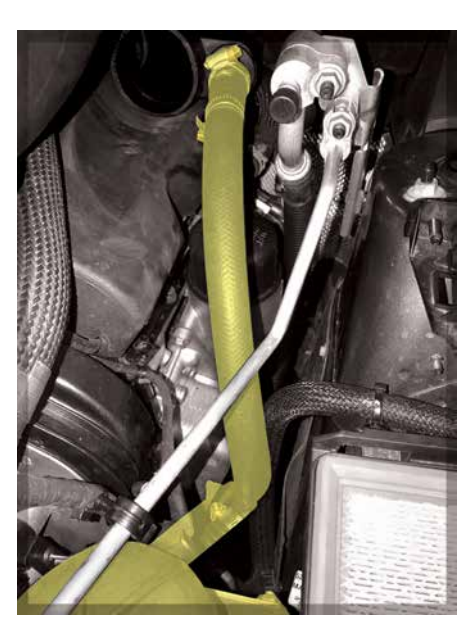
Step 9 / Img 7 :