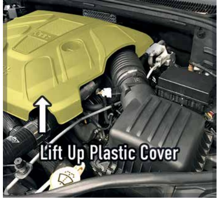
Step 2 / Img I: