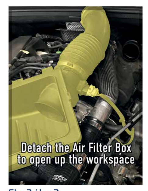
Step 3 / Img 2: