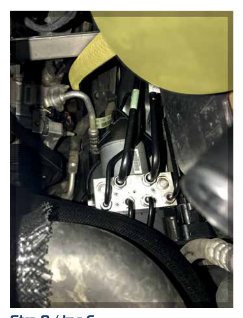
Step 8 / Img 6: