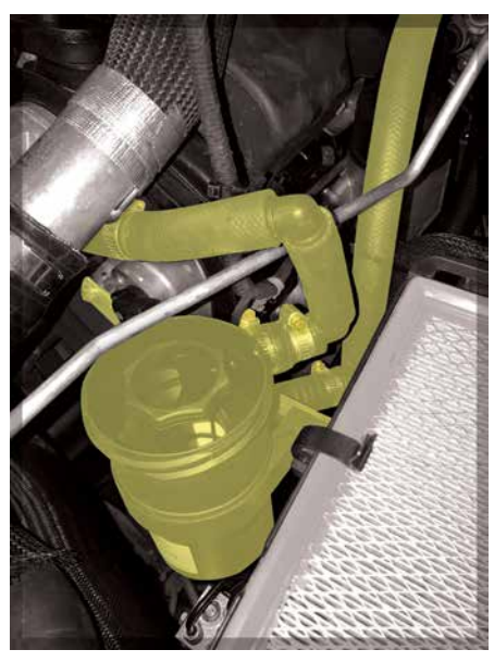
Step IO / Img 8: