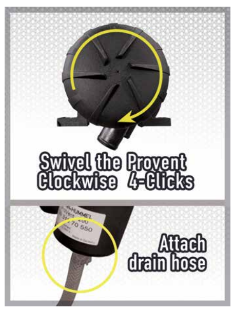
Step 6 / Img 4: