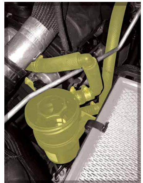
Step 10 / Img 8: