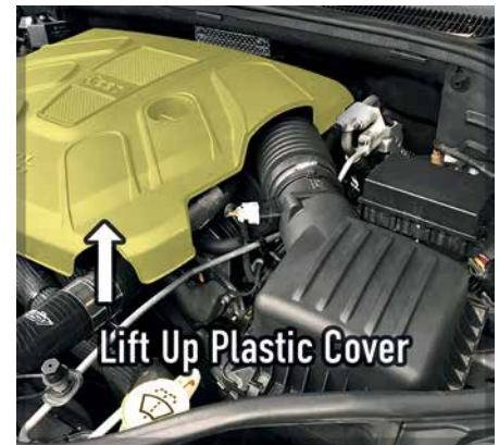
Step 2 / Img 1: