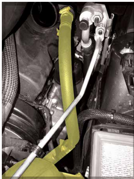
Step 9 / Img 7: