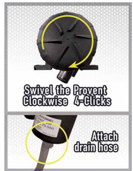
Step 6 / Img 4: