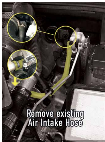
Step 4 / Img 3: