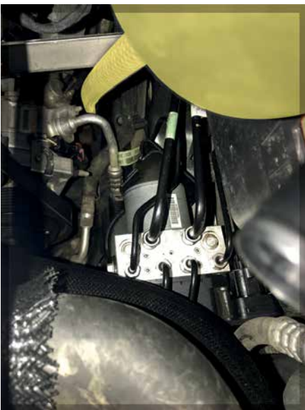
Step 8 / Img 6: