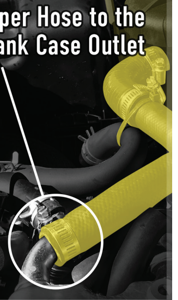
Step 9 / Img 7: