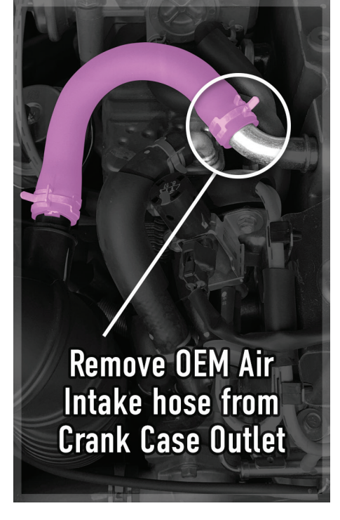
Step 7 / Img 5 :