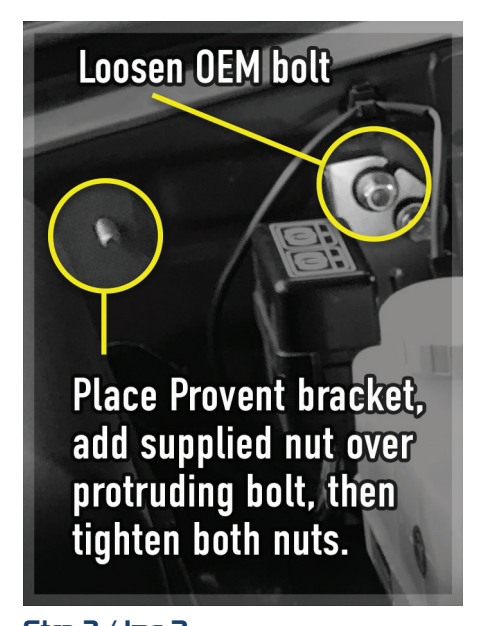
Step 3 / Img 2: