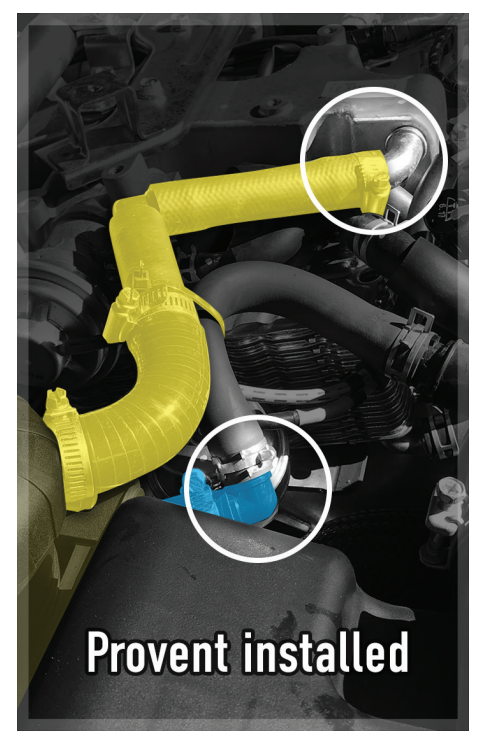
Step IO / Img 8: