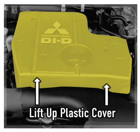
Step 2 / Img I: