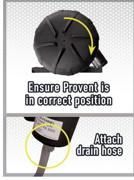
Step 4 / Img 3: